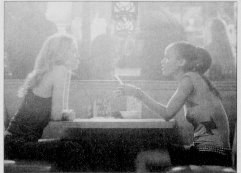
Kate Hudson (left) stars as Caroline, a live-in nurse who uncovers a terrifying secret and Joy Bryant (right) stars as her best friend, Jill.

Featured as the female lead in "Antwone Fisher" with Denzel Washington, Bryant's character acts as the voice of reason in the