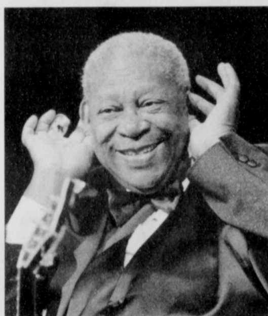
B.B. King performs during his birthday celebration in Biloxi, Miss.

(AP) - Bruce Willis, Dr. John and Kenny Wayne Shepherd were among the artists on stage with blues legend B.B. King during a special birthday benefit to raise money for a museum bearing the musician's name.