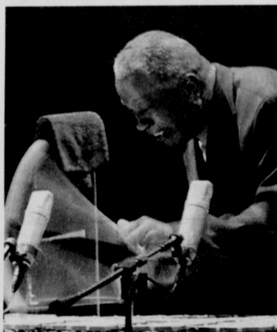
"To play music is like the sun coming up." Bobby Hutcherson

Ask about our stock rim with purchased. Limited to stock on hand. Now Dealing In New Rims! We will try to meet or beat any price on tires & wheel packages. Call for pricing on other sizes and brands. Used tires $15 & up