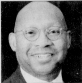
HUD Secretary Alphonso Jackson

"The Americans with Disabilities Act, the landmark legislation signed 15 years ago, has made great strides in reducing barriers to people with disabilities