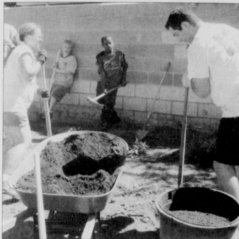
Volunteer labor helps bring the dream of homeownership to reality in Gresham.

Wells Fargo team members have been helping build the project since the start. About 50 Wells Fargo volunteers were on site Thursday to paint, plant greenery and install wiring. The grant amount is based on the more than 2,480 volunteer hours that Wells Fargo team members and their friends and family members have worked on the project so far.