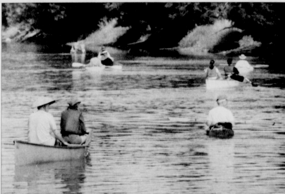
Local paddlers make their way through the Columbia Slough. More than 500 people showed up to last year's Small Craft Regatta. The annual event takes place this Sunday.