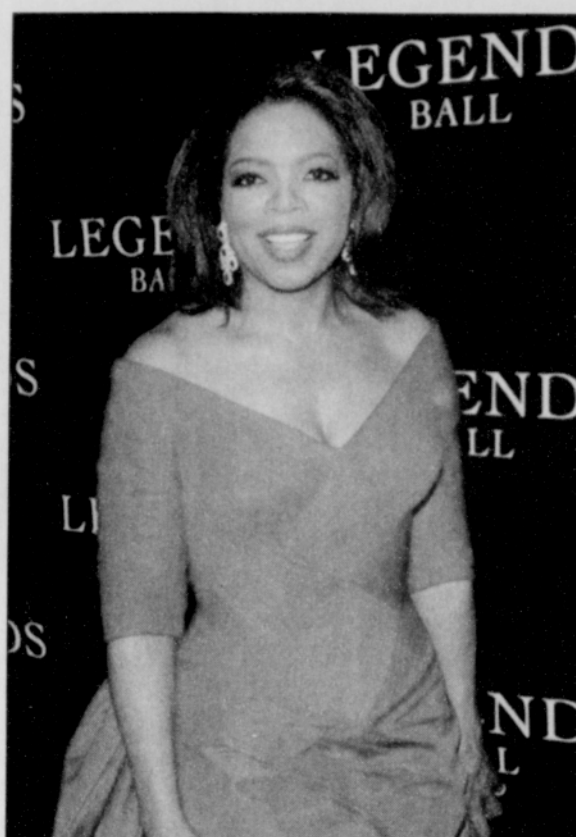
Oprah Winfrey (right) arrives at the Legends Ball, an award ceremony hosted by Winfrey honoring women who paved the way in arts, entertainment and civil rights in this Saturday, May 14, 2005 photo in Santa Barbara, Calif.

1994 between the Tutsi and Hutu ethnic groups. An estimated 600,000 to 800,000 people were killed, most of them Tutsis.