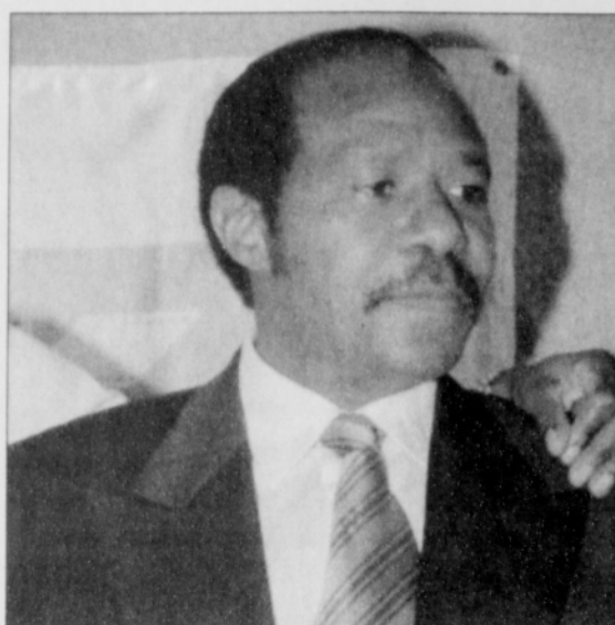
Paul Rusesabagina (Portrayed in "Hotel Rwanda")

Rusesabagina was managing a Belgian hotel in Kigali, the Rwandan capital, when civil war broke out in