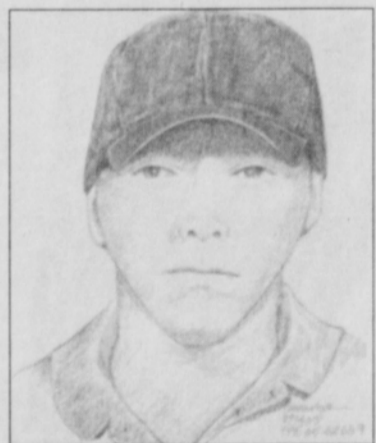
A police sketch shows the suspect of a sexual attack.

The suspect is described as possibly Asian or Hispanic, 25 to 35 years old, 5 feet 1 with a thin build. He was wearing a polo-type shirt, dark baggy pants and a dark colored baseball cap and appeared to be a "clean cut col-