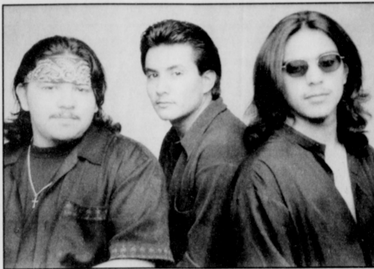
A family band, Los Lonely Boys will fuse southwest and Latino rock during their Aug. 11 performance at the Oregon Zoo Summer Concert Series.