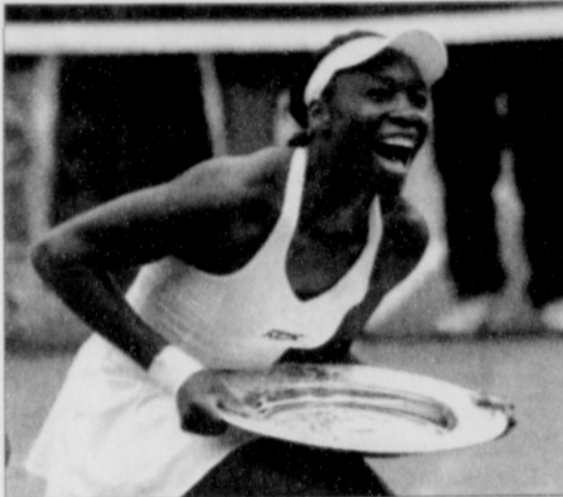
Venus Williams clutches her trophy after defeating Lindsay Davenport to win the Women's Singles final on the Centre Court at Wimbledon Saturday.

"I feel great to have accomplished this, but I feel like I want to