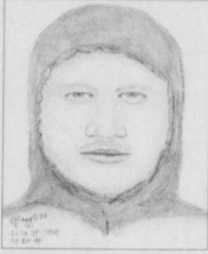
Police sketch of Taco Bell robbery suspect.

Crime Stoppers is offering a cash reward of up to $1,000 for information that leads to an arrest in this case, or any unsolved felony. All calls may remain anonymous at 503-823-4357.