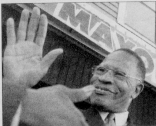
Mayor Sharpe James shakes hands with voters.

A son of civil-rights activists who integrated a white neighborhood in northern New Jersey, Booker is a poster child for the move-