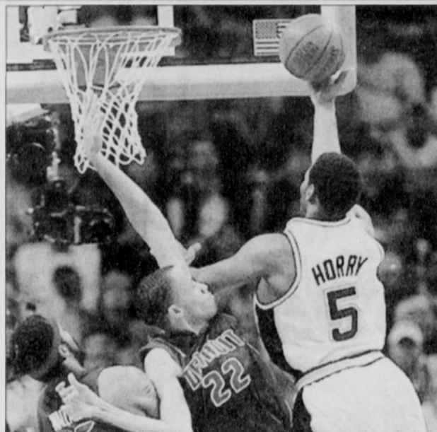
San Antonio Spurs' Robert Horry drives to the basket as Detroit Pistons' Tayshaun Prince (22) and Rasheed Wallace try to defend during game two of the NBA finals Sunday in San Antonio.

"He does a little bit of everything," said Nazr Mohammed, who Horry usually replaces off the bench. "He makes the right plays."