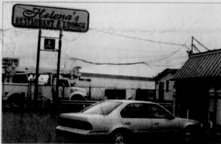
Helena's Place, a popular club with African Americans at 535 N.E. Columbia Blvd. has closed in the wake of OLCC enforcement against its liquor license.