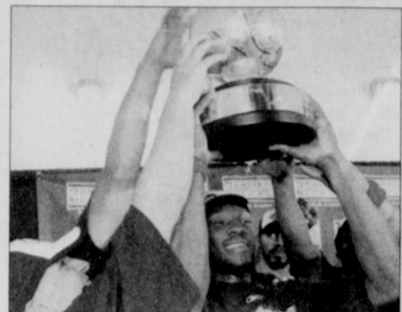
Detroit Pistons' Ben Wallace lifts the Eastern Conference Trophy Monday after defeating the Miami Heat during game seven of the Eastern Conference finals in Miami.

(AP) — It'll be a much anticipated first game, with shouts and screams hurled toward television sets across the nation on Thursday night. Defending champions the Detroit Pistons beat the Miami Heat 88-82 Monday night in Game 7 of the Eastern Conference finals, advancing to face the San Antonio Spurs in the NBA Finals.