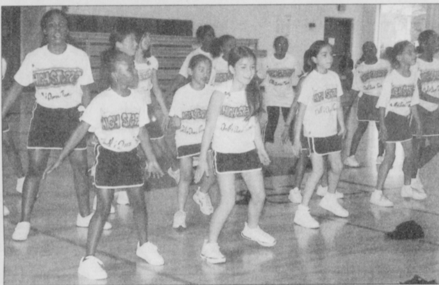
The High Steppers Drill and Dance Team was just some of the local entertainment provided at Saturday's charity event.