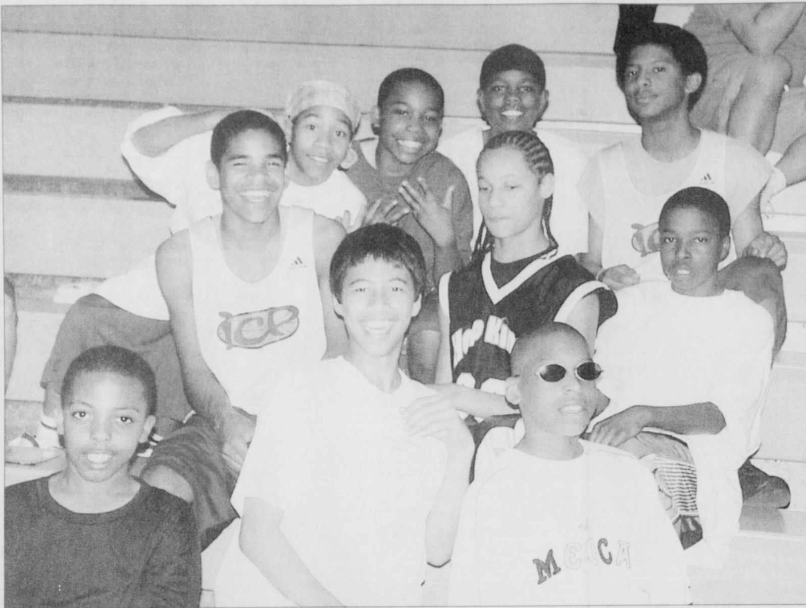
Members of the Inner City Players Disciples and Hoop Kings have a good time at the Cory Washington Memorial Basketball Tournament.