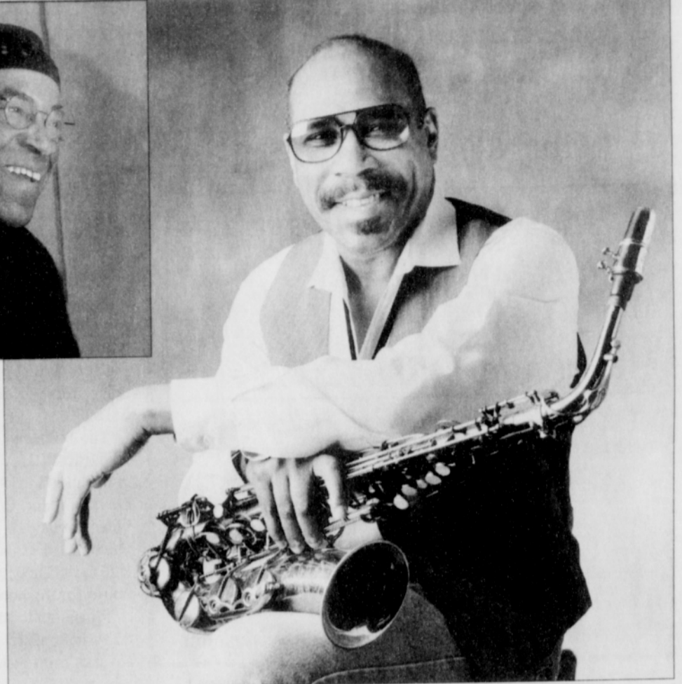
Veteran saxophonist-flutist Sonny Fortune will perform June 2 at downtown's Old Church.