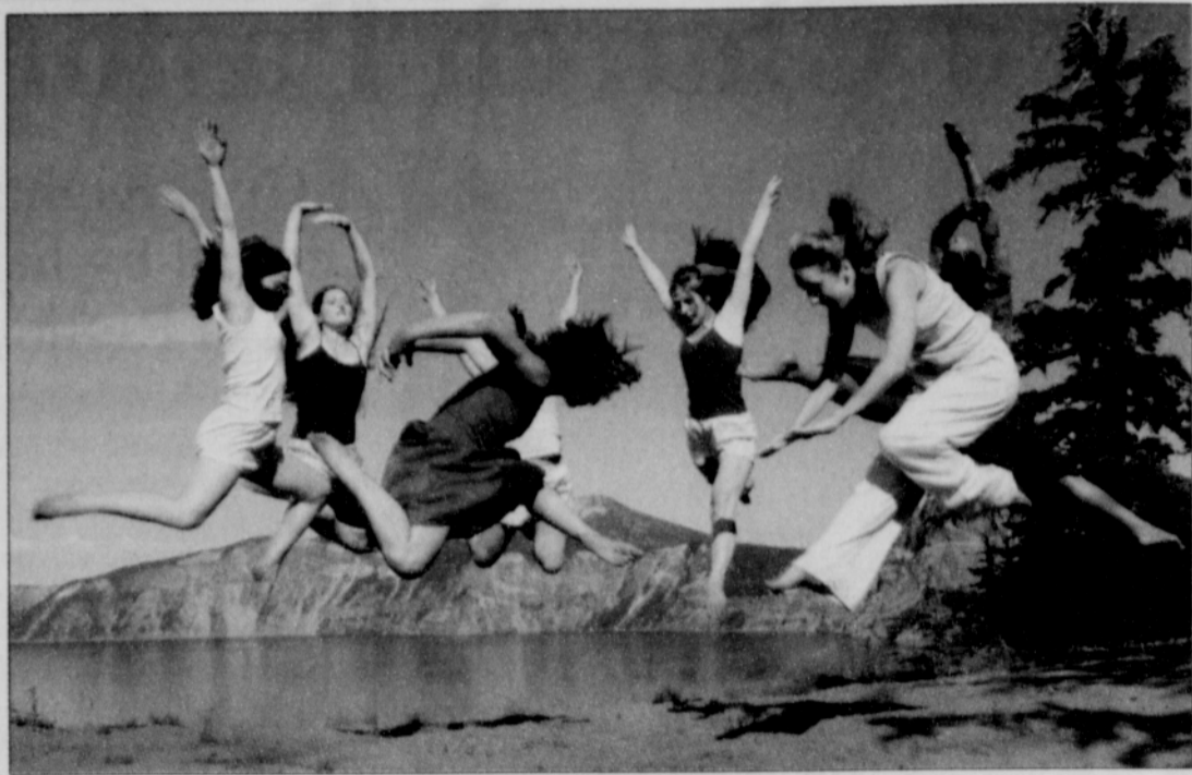
Members of the Kinetic Image Dance Company perform Kinetic Images Dance Company are known for blending life dance and videography.