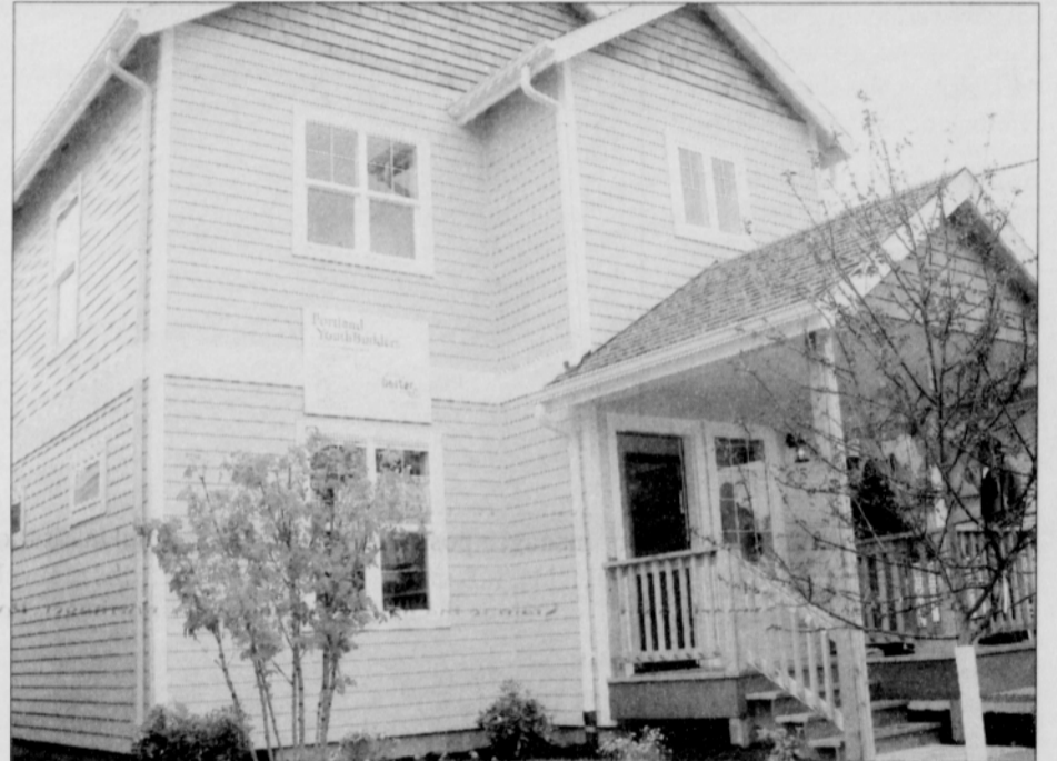
A partnership between advocates of vocational training for youth and affordable housing for adults resulted in the construction of this new at Northeast Sixth Avenue and Killingsworth Court.