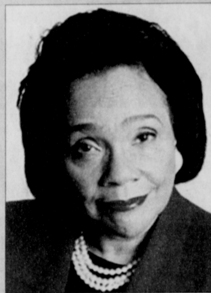
Coretta Scott King