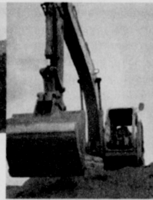
HEAVY DUTY REPAIRER