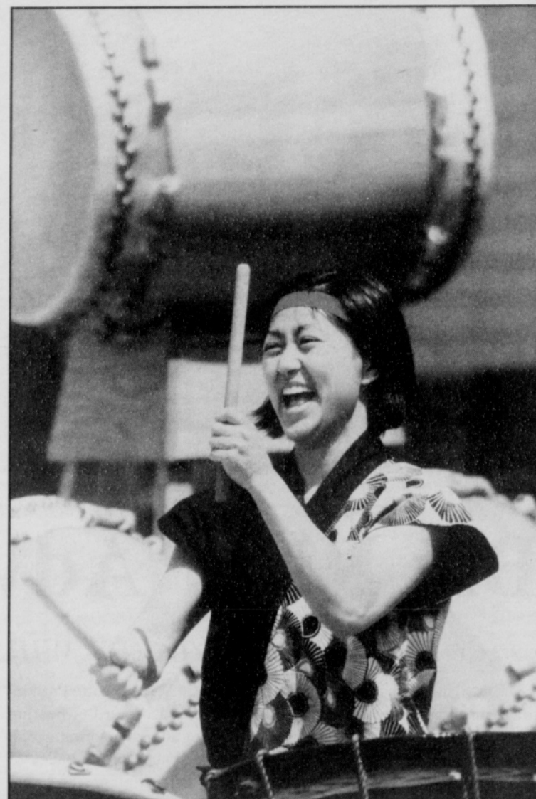
A member of the award-winning Asian American drumming ensemble, Taiko.