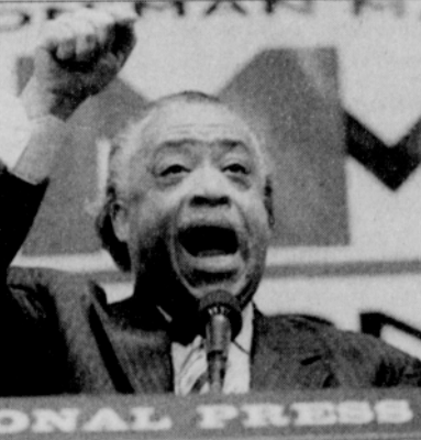
Rev. Al Sharpton speaks at the National Press Club in Washington to announce the Millions More Movement in October to mark the 10th anniversary of the Million Man March.

"When will someone in the African-American community stand up and say that the Million Man March had a positive message but the pied piper is a racist and anti-Semite?" said ADL director Abraham Foxman.