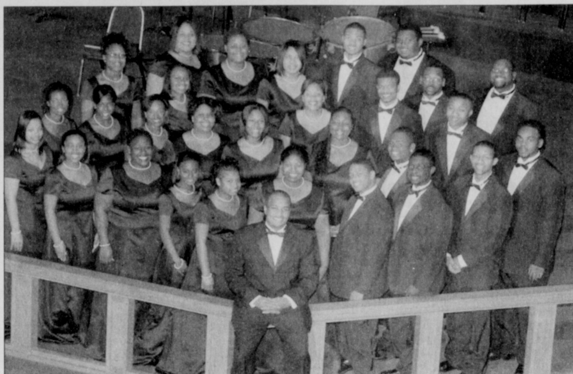
The Wilberforce Choir will bring music ranging from Broadway hits to African-American Spirituals during a Monday, May 16 performance at Bethel AME Church.