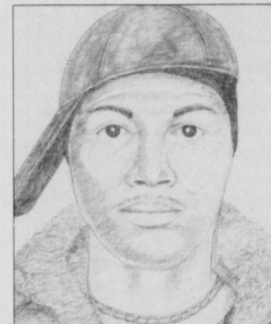
Portland police released this sketch of a rape suspect.

cap, with a "do-rag," a white tank top "wife beater," a fur lined black puffy jacket and dark baggy jeans. Anyone with information about this case or who can identify the suspect is asked to call Crime Stoppers. Crime Stopper is offering cash reward of up to $1,000 for information reported that leads to an arrest in this case or any other unsolved felony. As always those with information can remain anonymous and can be reached at 503-823-4357