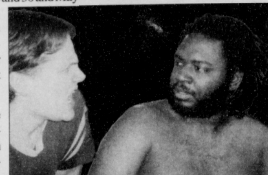
Jesus Christ Superstar

Mississippi Art Walk - Mississippi Avenue will be debuting the monthly Second Thursday Art Walk on April 14 at 5 p.m. with participating businesses along North Mississippi Avenue between Skidmore and Fremont Streets.