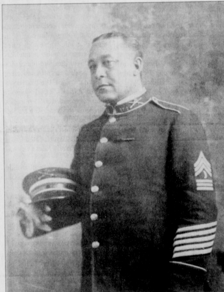
These are just a few of many buffalo soldiers that served.