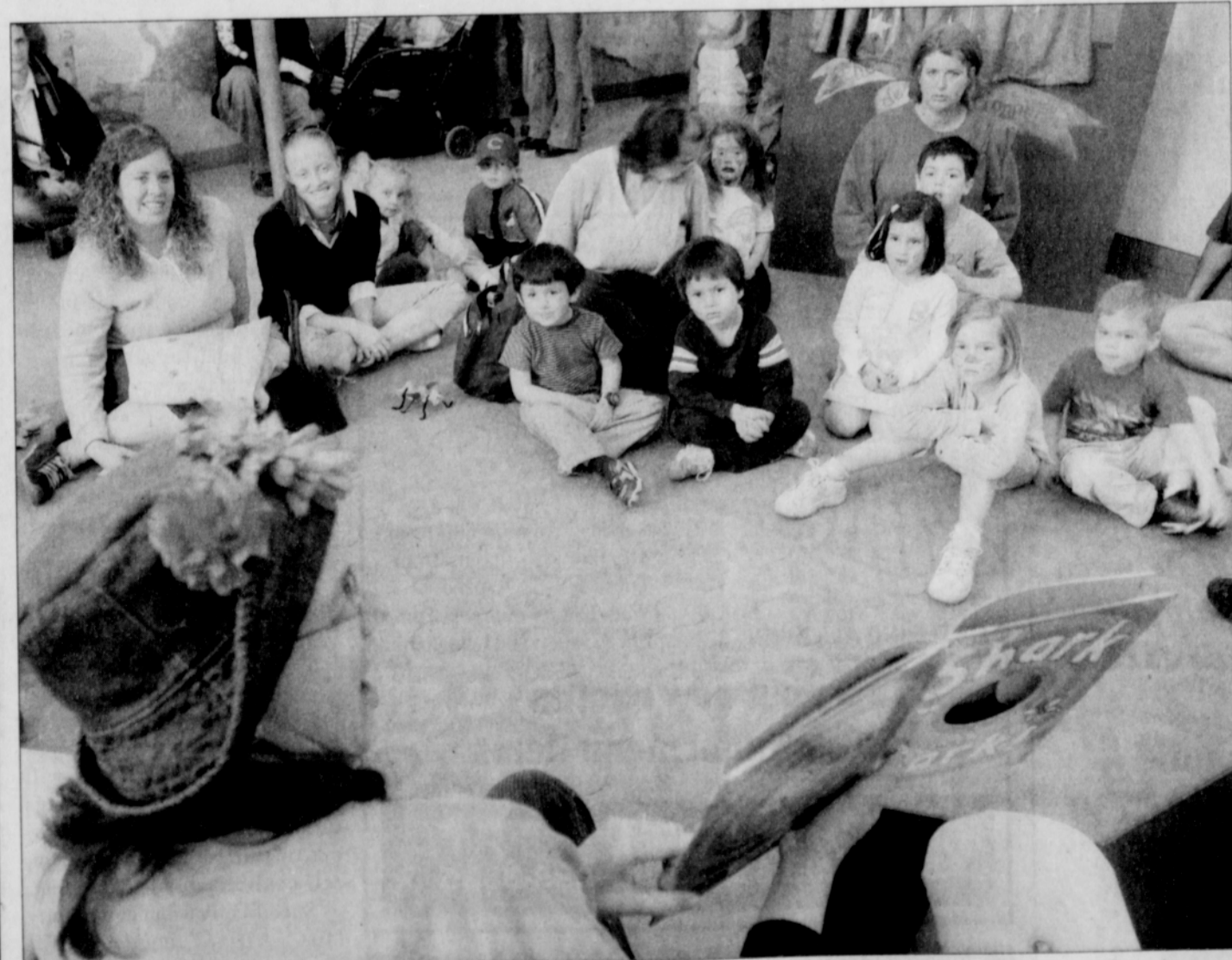
Special story times are part of the scheduled activities for Day of the Young Child on Sunday, April 10 at Portland Children's Museum.