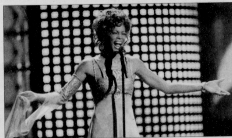
Recording artist Whitney Houston performs at the 2004 World Music Awards on Sept. 15, 2004, at the Thomas and Mack Arena in Las Vegas.

C-Murder's new album, "The Truest (Expletive) I Ever Heard," was released last week.