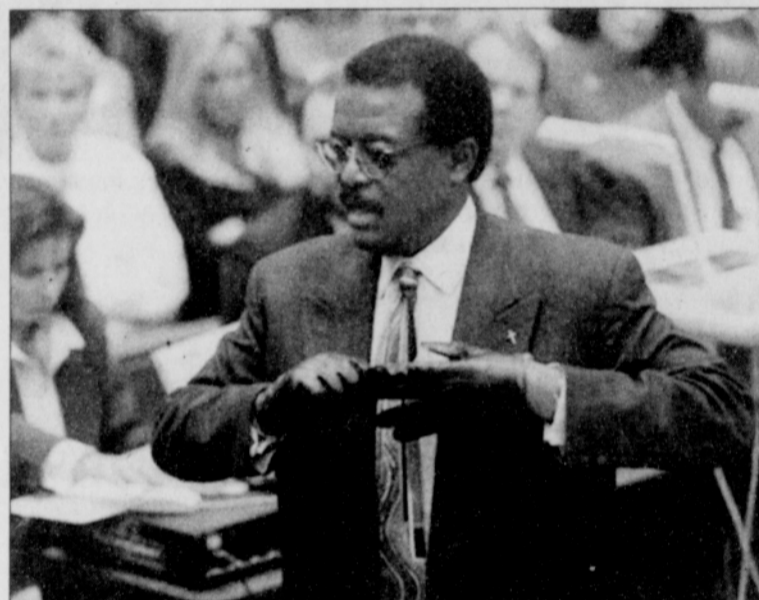
Defense attorney Johnnie Cochran Jr. puts on a pair of gloves in this Sept. 27, 1995 file photo, at the Los Angeles Criminal Courts Building, to remind the jury in the O.J. Simpson double-murder trial that the gloves Simpson tried on did not fit him. "Remember these words," Cochran said.

For Cochran, Simpson's acquittal was the crowning achievement in a career notable for victories, often in cases with racial themes.