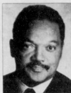
BY REV. JESSE L. JACKSON SR.

Beware the stranger bearing gifts. Or as the law teaches, caveat emptor: buyer beware. Look before you