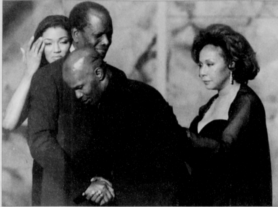
Jamie Foxx receives congratulations from actors Sidney Poitier, left, and Diahann Carroll, right, after he won the Outstanding Actor in a Motion Picture award for his performance in the film "Ray," at the 36th NAACP Image Awards at the Dorothy Chandler Pavilion in Los Angeles, Saturday, March 19.

In her acceptance speech, Washington said the country needs the NAACP's activism more than ever.