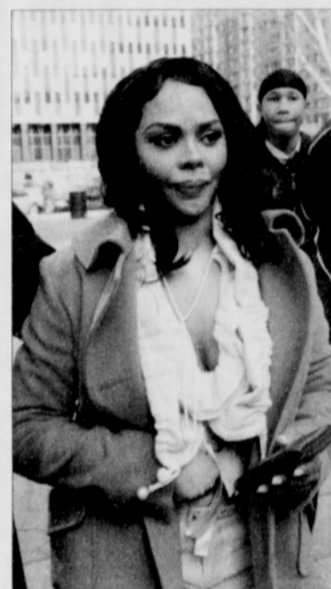
Lil' Kim enters federal court in New York before her conviction of lying to a grand jury in connection with a shooting.