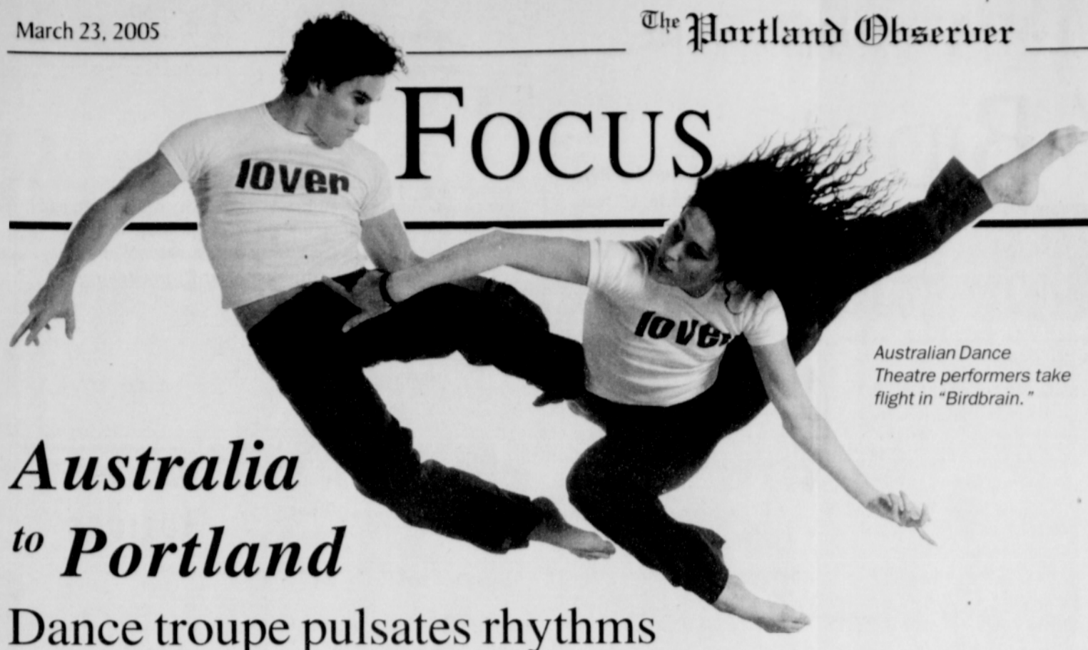
Australian Dance Theatre performers take flight in "Birdbrain."