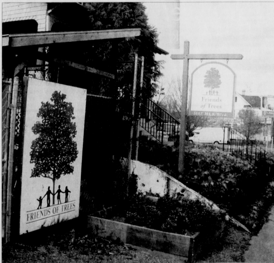
Fruit trees will be distributed free Saturday at the Friends of Trees headquarters at 3117 N.E. Martin Luther King Jr. Blvd.