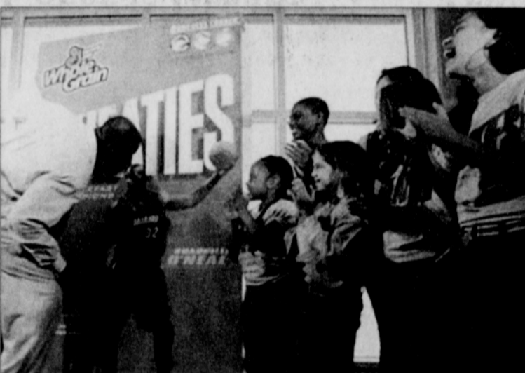
Shaquille O'Neal kisses the top of his head on a Wheaties cereal box to the delight of the Miami Heat's junior cheering squad.

(AP) — Shaquille O'Neal's taste in breakfast cereals might be changing.