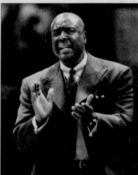
Cleveland Cavaliers coach Paul Silas was fired after his team dropped from first place to fighting for a playoff spot.