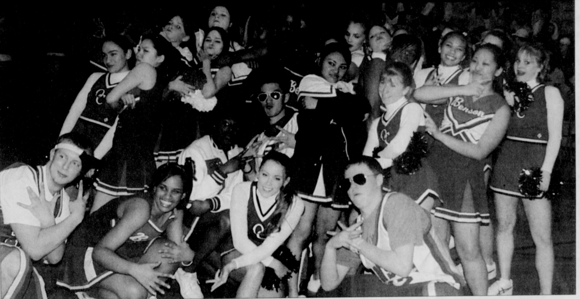
The cheerleading squads of both Benson and Oregon City join forces to bring fun and excitement to the 4A State Boys Basketball Tournament at Benson High School. The Techmen beat the Pioneers last Wednesday at home and scored a victory against Hermiston Saturday on the road to make the final tournament pairings beginning Thursday at Mac Court in Eugene.