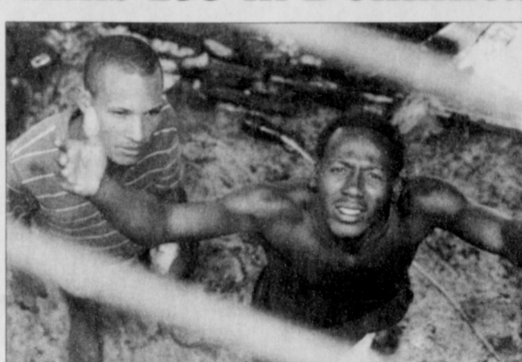
Two prisoners show relief for having survived a fire at a jail in Higuey, Dominican Republic on Monday.

seeing are dead or badly wounded." top of each other.'