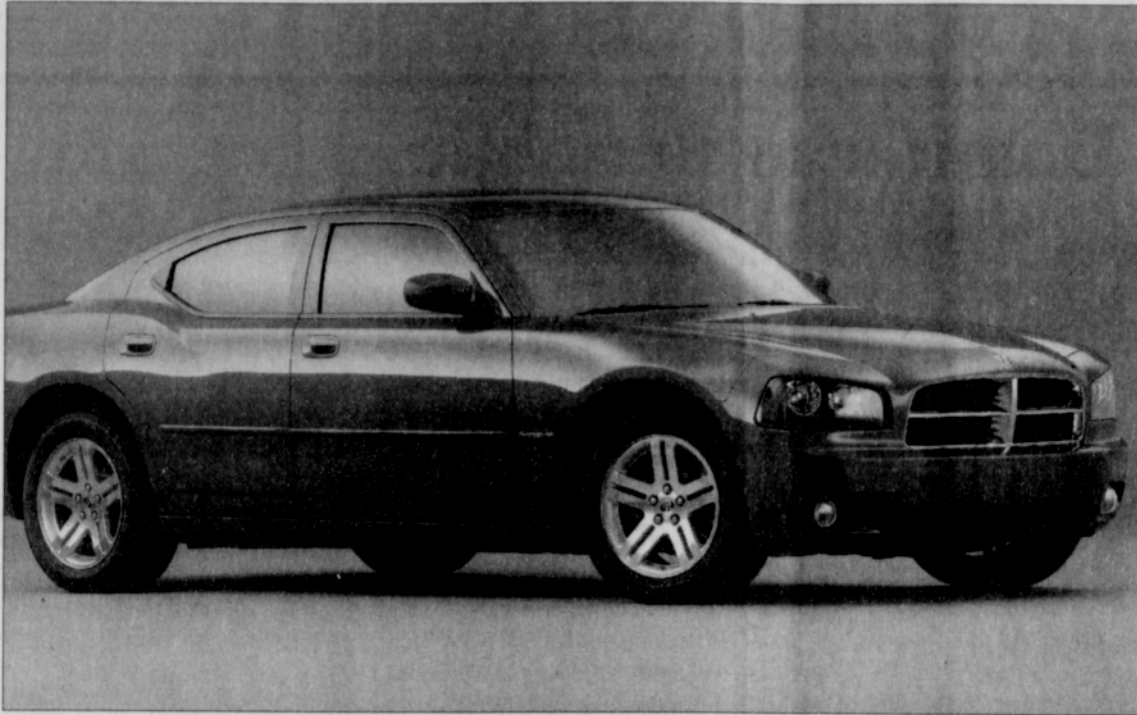
Tested Vehicle Information: Price: $44,520; Engine: 2.5 liter intercooled light pressure turbo, 6 cylinder Alloy Engine; Transmission: Geartronic 5-speed automatic w/adaptive shift logic and winter mode.

The Multiple Displacement System (MDS) on the Dodge Charger's HEMI engine seamlessly deactivates four cylinders in just 40 milliseconds — quicker than a blink of an eye — when full V-8 power is not needed, improving fuel economy by up to 20 percent. The HEMI engine with MDS completed more than 6.5 million customer-equiva-