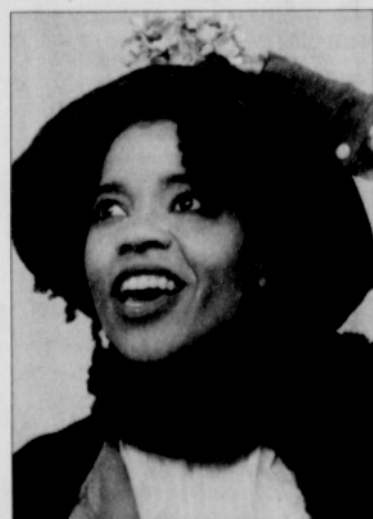
"My Fair Lady" by Portland Center Stage

Oregon Ballet Theatre - The Oregon Ballet Theatre presents "Body, Mind, Spirit" at the Keller Auditorium on March 5, 11, 12 at 7:30 p.m. and March 6 at 2 p.m. Tickets can be purchased by calling 503-222-5538 or by visiting 818 SE 6th Avenue between Belmont and Morrison.