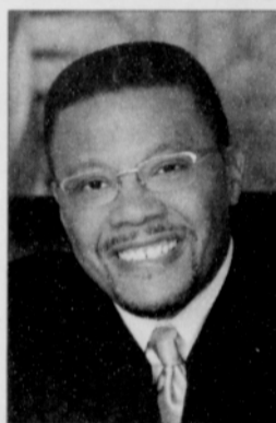
Judge Greg Mathis

A six-month study conducted by the Detroit News revealed some eye opening realities. The tax cuts intended by President Bush will inevitably cause more cuts in federal programs. Today, nearly $36 million or 13 percent of Americans live in poverty, not including the tens