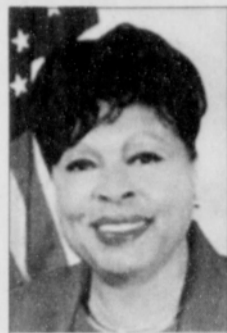
U.S. Rep. Diane Watson

Among the casualties are funding for Byrne Grants to help state and local law enforcement control violent and drug-related crime; community policing programs to hire additional officers;