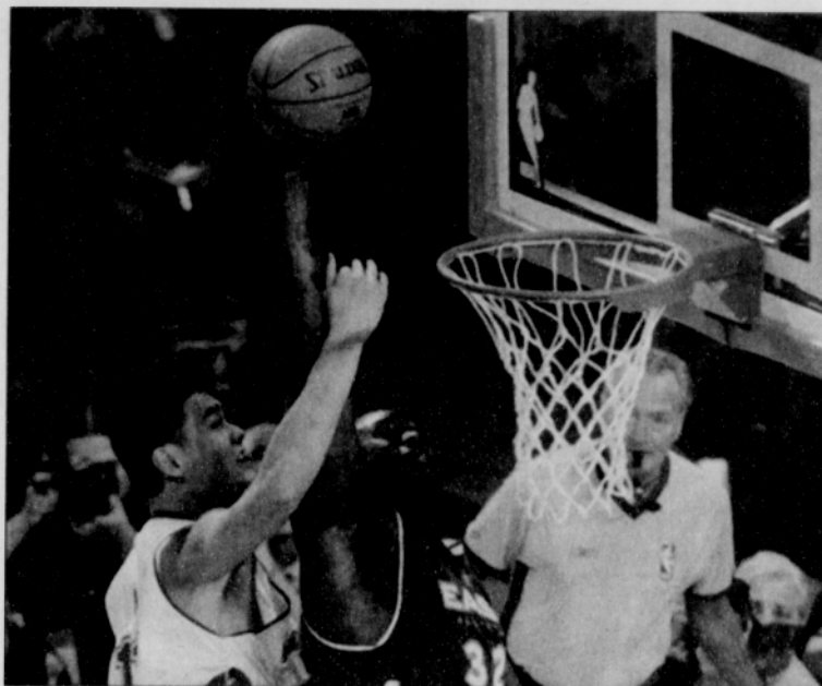
West center Yao Ming (left) tries to defend as Shaquille O'Neal goes for a slam during the NBA All Star game in Denver.

For the second straight year, O'Neal made people laugh, applaud