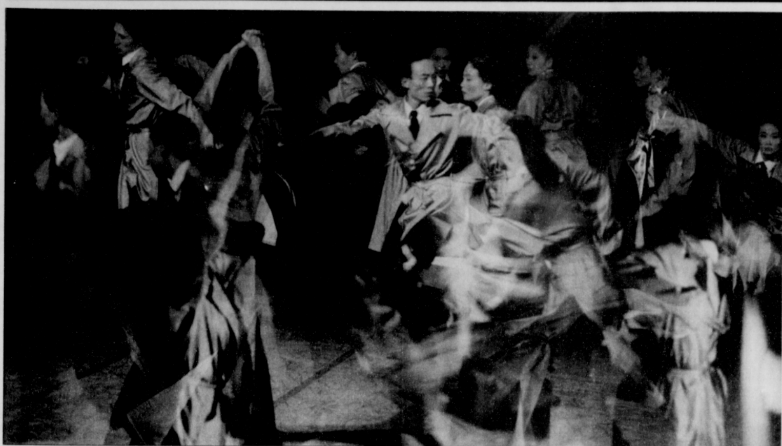
Chinese culture and a thirst for freedom are characterized in the movements of the Beijing Modern Dance Company.