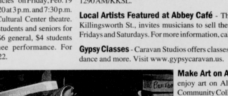
Black Panther Photo Exhibit at Reed College

Trippin' through Town - Take a trip through time to find the hottest poetry, hip hop and soul influencing Portland on Wednesdays at the