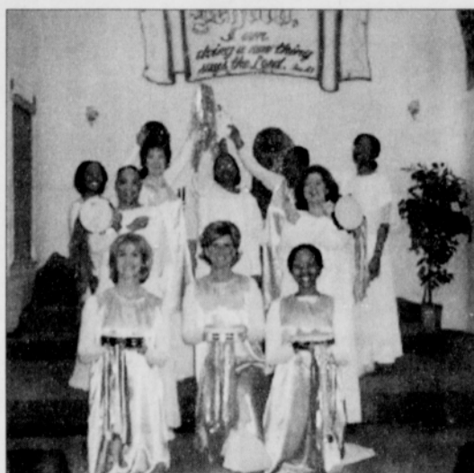
Northeast Community Fellowship Dance Team.