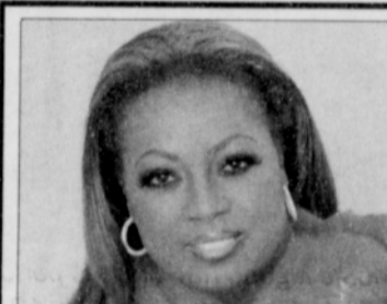
Caption: Star Jones will host E! Red Carpet for upcoming award shows.

Performances will be held on Saturday, Feb. 19 at 7:30 p.m. and Sunday, Feb. 20 at 3 p.m. and 7:30 p.m. at the IFCC Theatre. Tickets are $10 general, $8 students and seniors for evening performances and $6 general, $4 seniors and students for the matinee performance. For more reservations, call 503-823-4322.