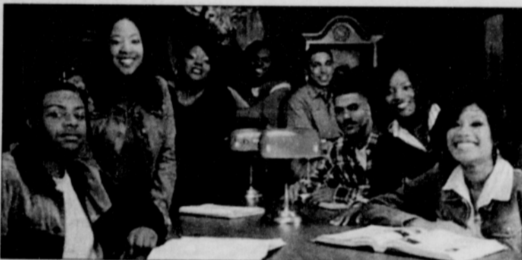
The cast of BET's "College Hill."

"College Hill" launched its 13-week run on BET last week at 9 p.m. in the "Wild Wild West" of the Oklahoma plains at Langston University with a special one-hour series premiere. Featured is a new cast of eight, but with the same saucy, volatile mix of eclectic personalities and on- and off-campus hijinx that marked its debut last season. From classroom to chaos, the network's cameras are there 24/7 to catch all of the action.