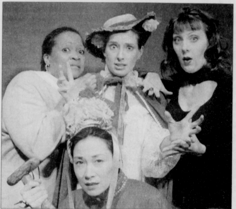
Bump in the Road Theatre presents "The Waiting Room."

Jefferson High School presents "Becoming American: A Hmong Perspective" on Monday, Feb. 7 from 6 to 8:30 p.m. Admission is