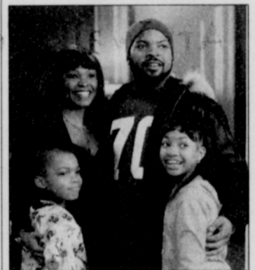
It's a wild ride for Ice Cube, star of the family comedy 'Are We There Yet?'