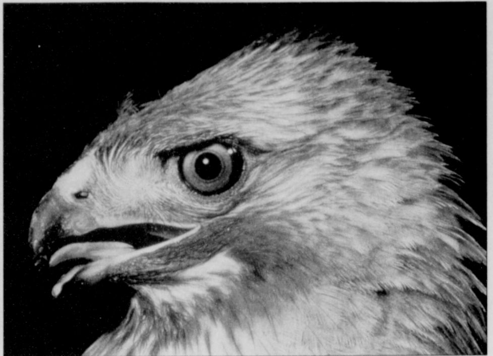
Bald eagles and red tail hawks are winter residents in the Portland metropolitan region.