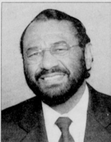
U.S. Rep. Al Green

We will work to ensure that people here and across the globe have the freedom, liberty and