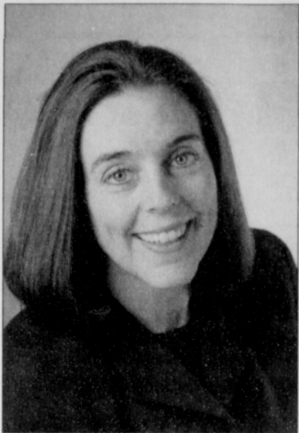
Sen. Kate Brown

as the first African American President Pro-Tempore of the Oregon Senate. A lawmaker representing north and northeast Portland, Carter is only the second African American woman in United States history