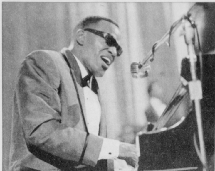
Actor Jamie Foxx received a best actor nomination for his role in "Ray," as well as a supporting actor nomination for "Collateral."