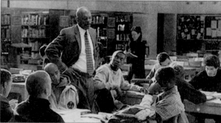
Samuel L. Jackson stars in "Coach Carter."