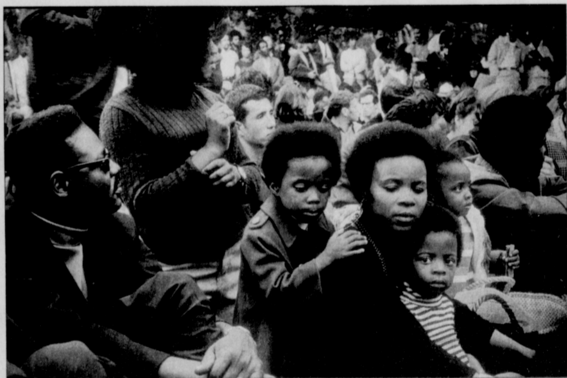
Historic photos showing entire families and multicultural crowds at a Black Panthers rally in 1968 are in radical contrast to mass media images at the time depicting the organization's members as thugs, criminals or dangerous subversives.

continued ▲ from Metro of their positions and actions," Snyder said. "However by bringing this work to Reed, we are certainly drawing attention to issues of social justice, race, poverty, edu-